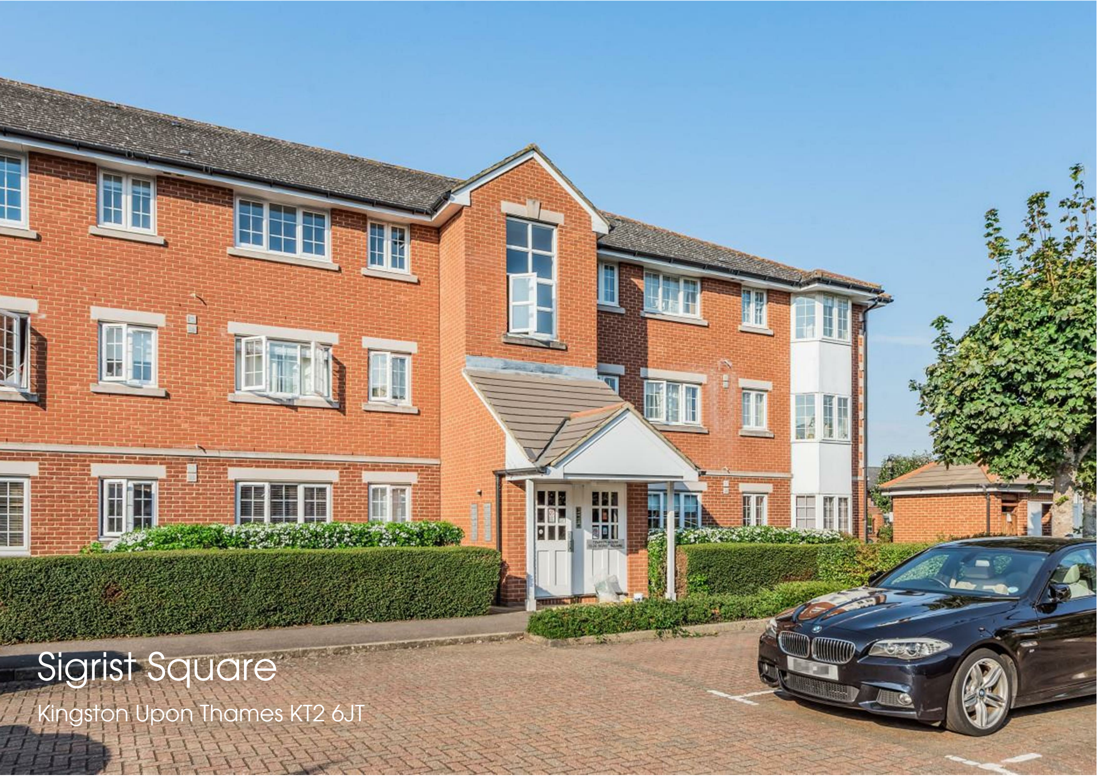
Sigrist Square Kingston Upon Thames KT2 6JT